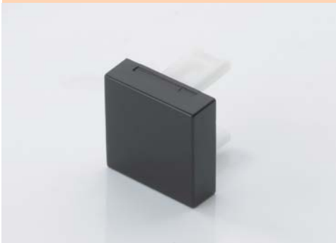
Lens, opaque for square pushbutton bodies, not for illumination