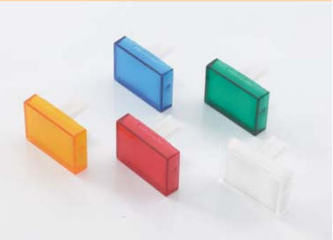
Lens, front transparent/rear translucent for rectangular indicator and pushbutton bodies