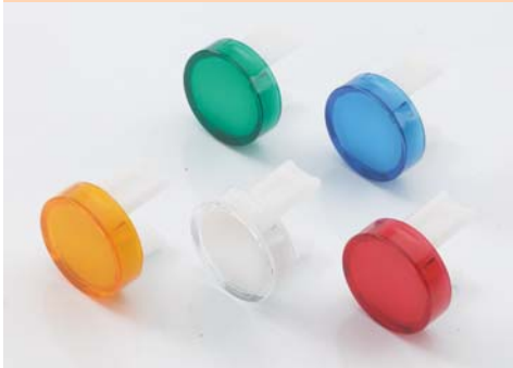
Lens, front transparent/rear translucent for round indicator and pushbutton bodies