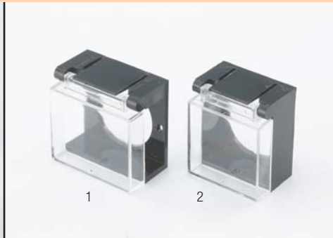
Flap guard, raised, square and rectangular