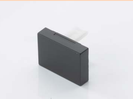
Lens, opaque for rectangular pushbutton bodies, not for illumination