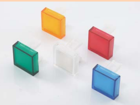
Lens, front transparent/rear translucent for square indicator and pushbutton bodies