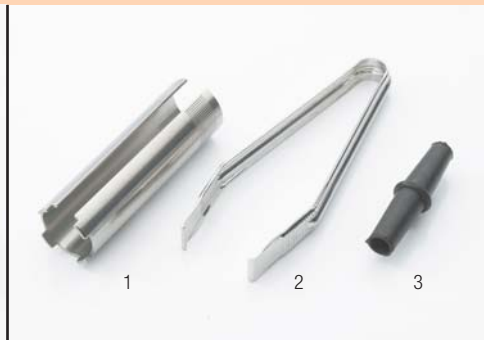
Mounting tool, lens and LED remover