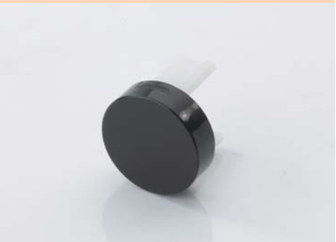
Lens, opaque for round pushbutton bodies, not for illumination