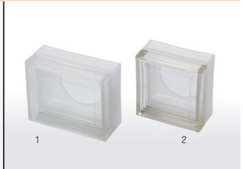
Sprayproof cover, square and rectangular, IP65