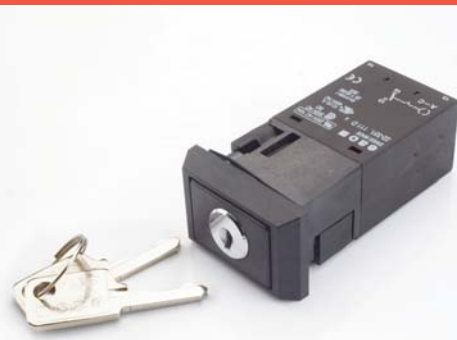
Keylock switch actuator, 2 position raised, rectangular, screw terminals