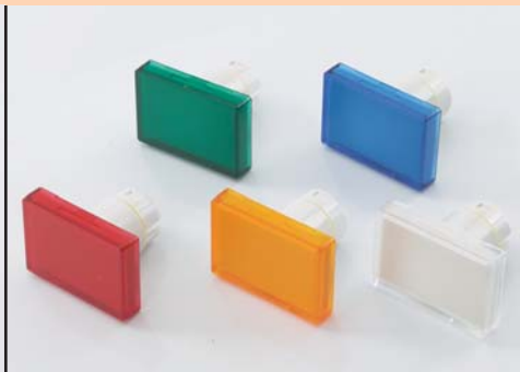
Lens, front transparent/rear translucent for rectangular indicator and pushbutton bodies