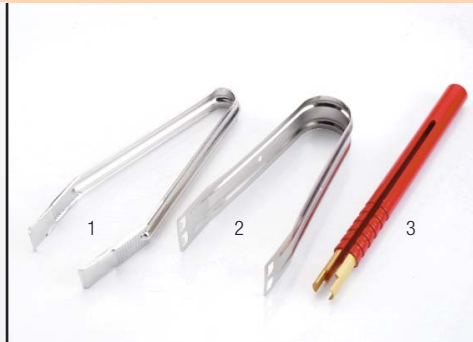
Lens remover for flat bezel, lens remover for raised bezel and LED remover