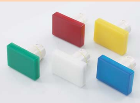
Lens, front translucent/rear translucent for rectangular indicator and pushbutton bodies