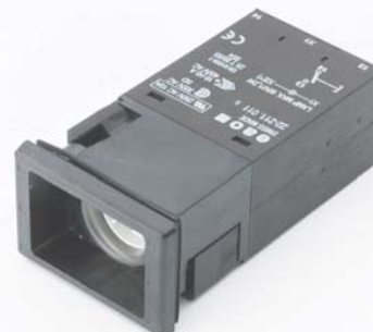
Illuminated pushbutton actuator, raised, rectangular, black plastic, screw terminals