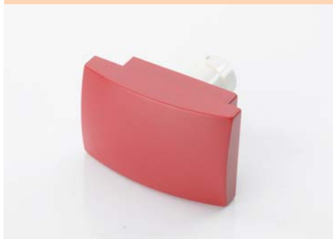
Mushroom head cap, not for illumination, opaque, red