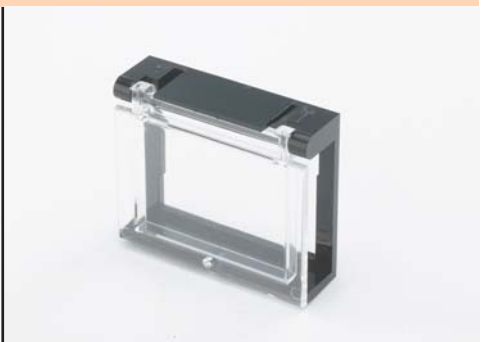
Flap guard, raised, rectangular