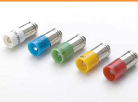
LED, T1 3 / 4 MG, single chip, 12 Volt and 28 Volt