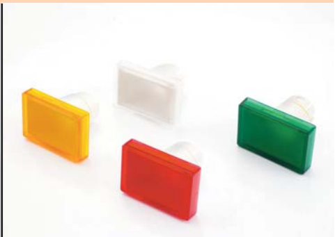
Lens, front transparent/rear transparent for rectangular indicator and pushbutton bodies