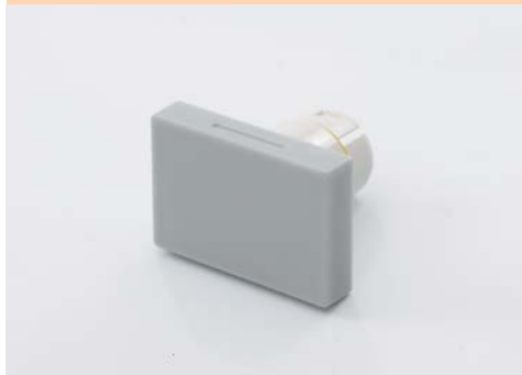
Lens, opaque for rectangular pushbutton bodies, not for illumination