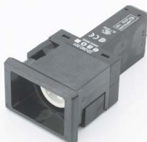
Indicator body raised, rectangular, black plastic